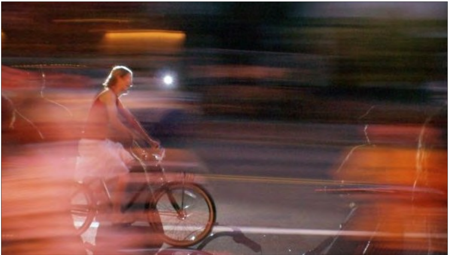
For the pure love of riding!

On Saturday, July 23rd, more than 1100 hardy souls will take on one of the hardest and longest running bike races in the country. Read more on page 9